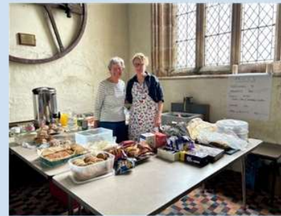
Refreshments, Lydeard St Lawrence