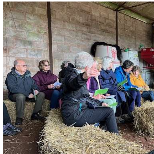
Rogation service, Shopnoller Farm