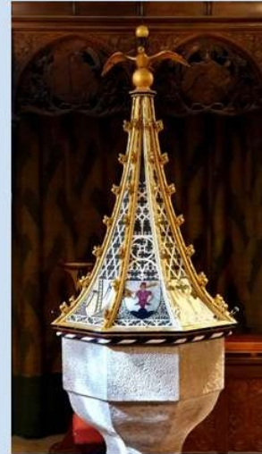
Font cover, Bagborough