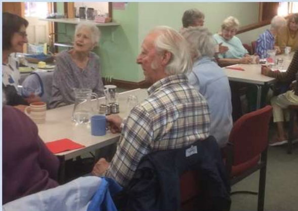
Sunday morning, Bishops Lydeard