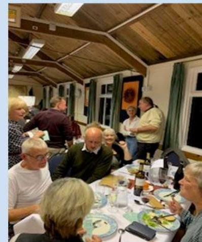
Harvest supper, Combe Florey

Bishops Lydeard, St Mary – Bagborough, St Pancras Combe Florey, Ss Peter & Paul – Cothelstone, St Thomas of Canterbury Lydeard St Lawrence, St Lawrence