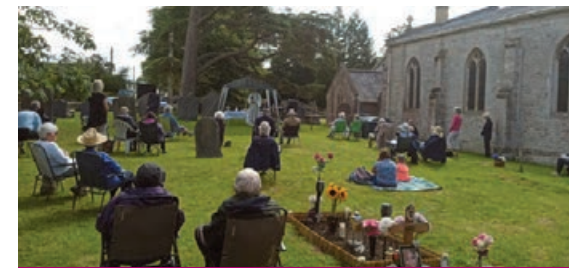
In Wookey, they brought deckchairs for a Sunday service in the sunshine.